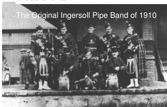
The Original Ingersoll Pipe Band of 1910